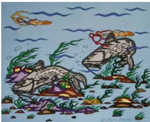
Waasisii Aadizookahn (Legend of the Bullhead) 16" x 20" oil paint, acrylic

To have people understand that the Ojibwe people and culture are vibrantly alive and well.