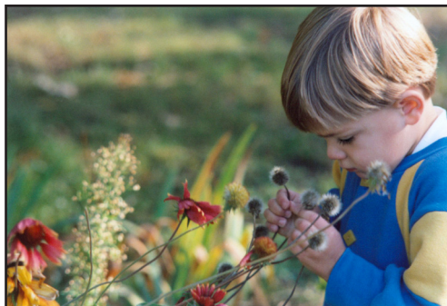
"Admiring God's Handiwork" 12" x 18" Photograph